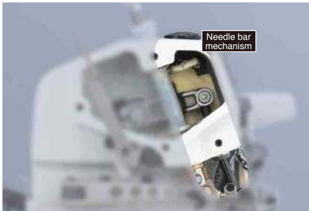
Needle bar mechanism