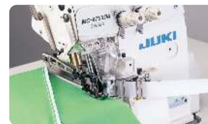
Rolling in tape MO-6745DA-FF4-360/N077 (N077: Clean finish top and bottom)