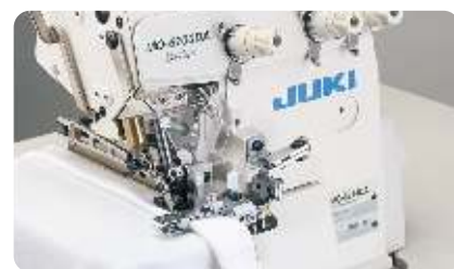
Blind hemming MO-6705DA-0D4-210/L121 (L121: Blind stitch hemming attachment)