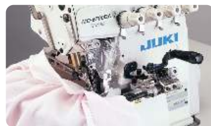
Gathering MO-6714DA-BE6-327/S162 (S162: Swing-type gathering device, manual-lever operated)