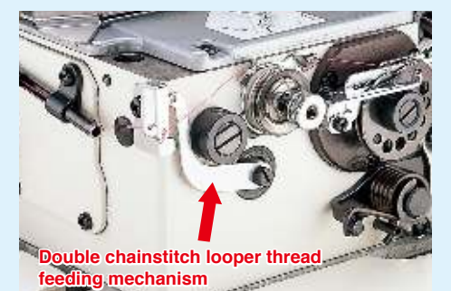
Double chainstitch looper thread feeding mechanism