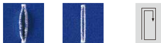
Without basting stitch With basting stitch Basting stitch (The state in which the material is stretched in the lengthwise direction after buttonholing)

Basting stitch : Since the needle thread is tucked in without fail, it will never jut out of the buttonhole seams. Basting stitch can be sewn by nine rounds.