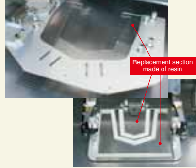
Pocket presser plate