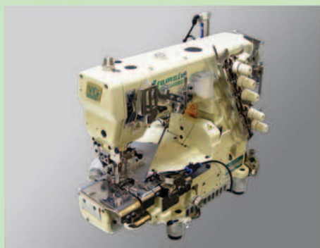
Yamato VG series Cylinderbed coverstitcher

"Q-finish" is made by a device "UTQ", to be fitted on YAMATO VG/VGS series cylinderbed coverstitch machines.